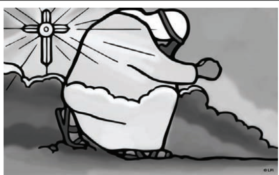
33<sup>rd</sup> Sunday in Ordinary Time ~ 17 November 2019

"This will give you an opportunity to testify. So make up your minds not to prepare your defence in advance; for I will give you words and a wisdom that none of your opponents will be able to with stand or contradict." Lk 21:13-15